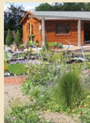
Caves Folly ‘Organic’ Shop