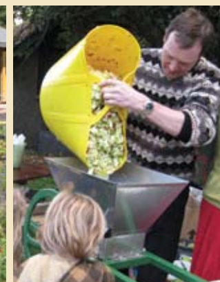
Apple juicing at Colwall Apple Day