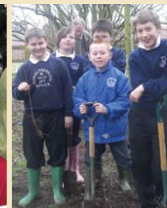
Eco Club at St Mary’s School, Bromesberrow