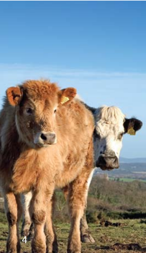
Top left: Cattle grid installed as part of the Malverns Heritage Project Left: Cattle grazing on Castlemorton Common