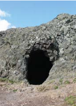
Pillow lava at Clutter's Cave

This document provides a summary of key points taken from the geodiversity chapter of the AONB Management Plan (2009-2014). It is intended to provide a quick and easy reference guide for users with a specific interest in this subject. Those intending to quote from the management plan and those who require a more detailed understanding should consult the document in full, available at www.malvernhillsaonb.org.uk .