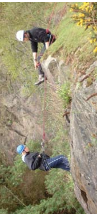
Abseiling at Tank Quarry

RIGS and other sites within the AONB such as Whitman's Hill Quarry can be used to draw visitors away from honeypot sites to explore other parts of the area. These sites can be promoted positively, and interpreted, for geological exploration provided due consideration is given to health and safety issues. (GP2, G02)