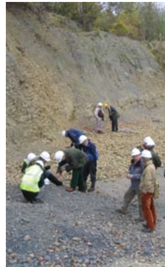
Fossil hunting at Whitman's Hill Quarry