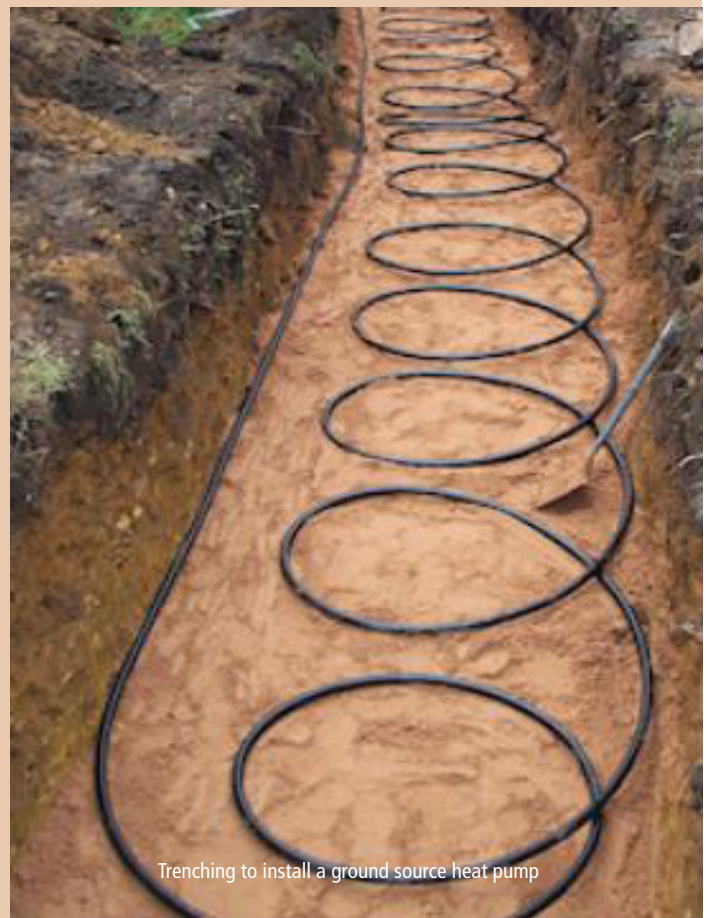
Trenching to install a ground source heat pump