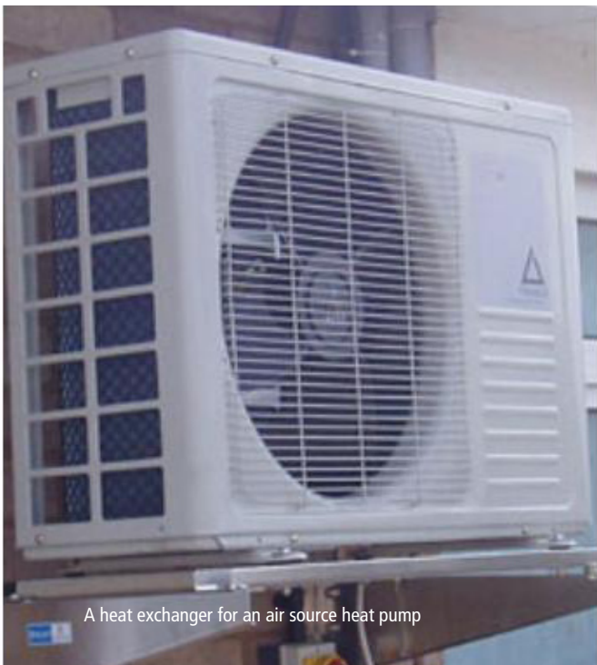
A heat exchanger for an air source heat pump