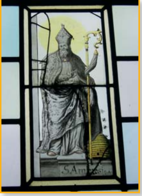
Window at Alfrick

Leaflets describing four cycling routes and a variety of local walking routes are available from the Malvern Hills AONB website and local tourist information points.