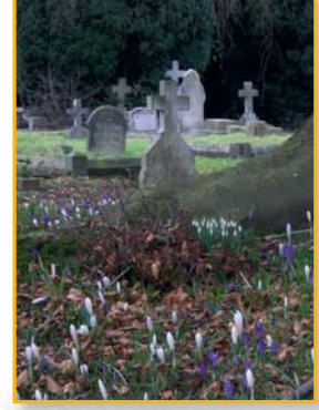
Great Malvern Cemetery

Take time to explore the wealth of interest and enjoy the peace and quiet of these churchyards or 'Living Sanctuaries'. as they have become known.