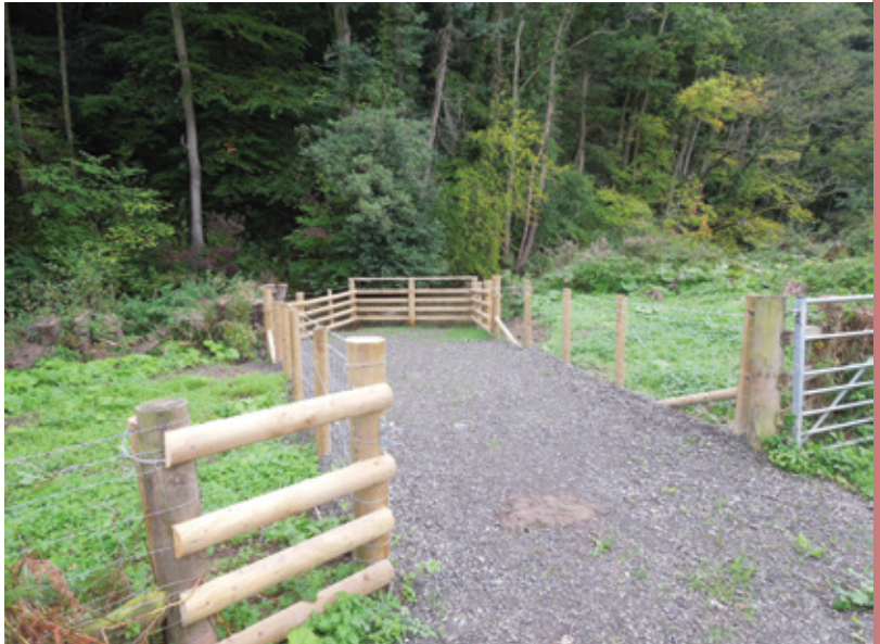
Cattle Drinker at the Knapp and Papermill Nature Reserve

The plan is to purchase the land outright to ensure that it remains under the care of Worcestershire Wildlife Trust. An appeal to raise £480,000 was announced; details can be found at: http://www.worcswildlifetrust.co.uk/fields-of-gold