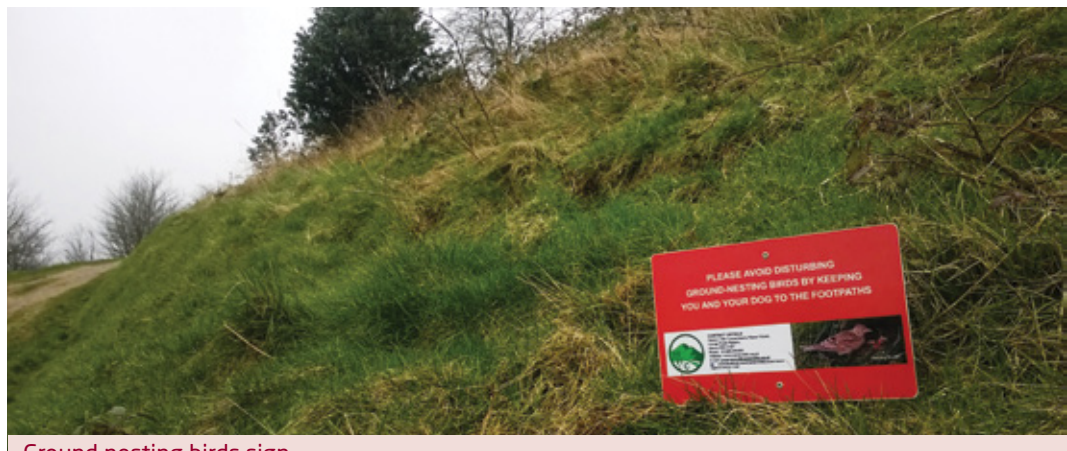
Ground nesting birds sign

Malvern Hills Conservators have continued their programme of grazing on the hills and commons to help maintain the condition of the nationally important grassland. Practical vegetation management has also been carried out, including 52ha of scrub removal. Other tasks carried out by both wardens and volunteers include: black poplar planting, coppice restoration, hay-cutting and also the erection of new signage for visitors about ground-nesting birds.