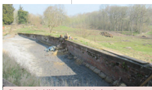
Clencher's Mill leat pond (drained)

Located on the Eastnor Estate, Clencher's Mill is a rare survival of a grade II listed, 18th century timber-framed water mill. It retains most of its internal workings, including a pair of millstones and an iron overshot waterwheel dating to 1820. During 2013/14 the estate made considerable progress towards restoring the mill to full working order. Funding support provided by Natural England and the AONB Partnership helped towards the repairs of the mill leat pond wall and future interpretation for the site. Works to fully restore the mill should be complete by the end of 2014.