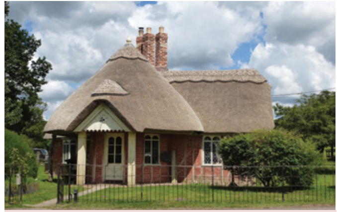
South Lodge, Bromesberrow