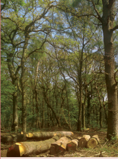
Woodland management, Gullet Wood