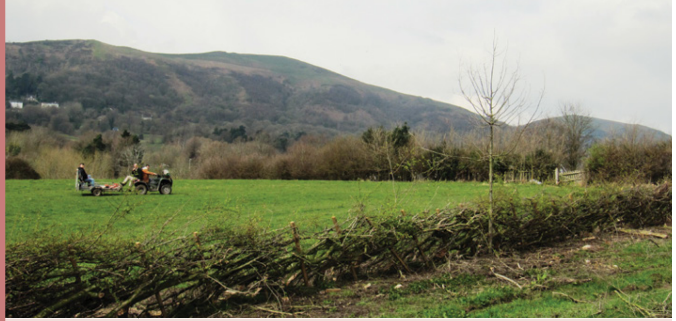
Hedgelaying at Poolbrook

AONB enhancement grants are aimed at smaller landowners who are not usually in receipt of agri-environment support. Unfortunately this grant stream has been reduced in size because of budget cuts.