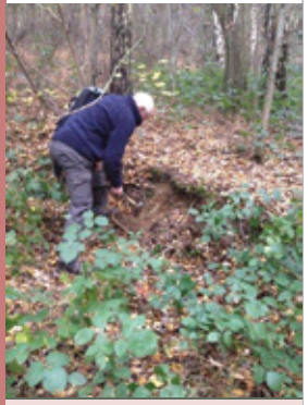
Geological monitoring work