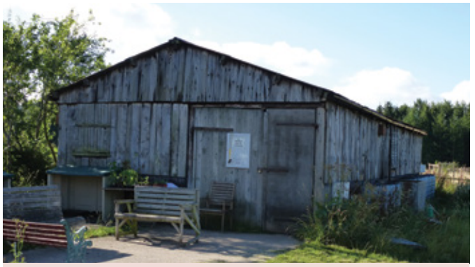
Apple packing shed