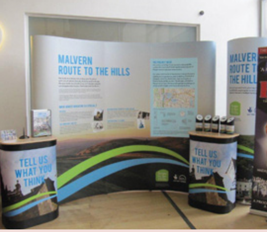
Route to the Hills display

Route to the Hills is the name of a project led by Malvern Hills District Council to link the town of Malvern to the Malvern Hills, with the right infrastructure such as signage and interpretation to help maximise social and economic benefits. The project has received a development grant from the Heritage Lottery Fund and consultants have been employed to put together a second bid for the delivery stage. The AONB Partnership has contributed £2,000 to the development stage work and is currently Vice Chair of the Project Board.