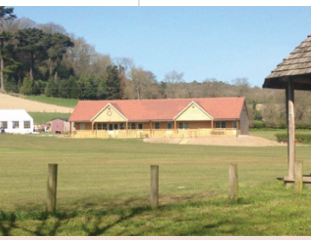
Eastnor Cricket Club Pavilion