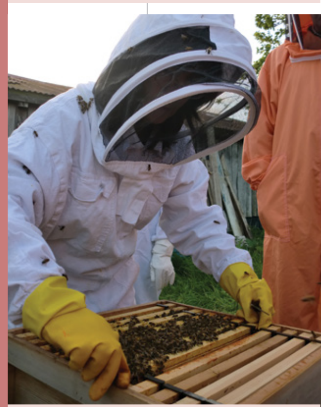
Colwall Orchard Group volunteers