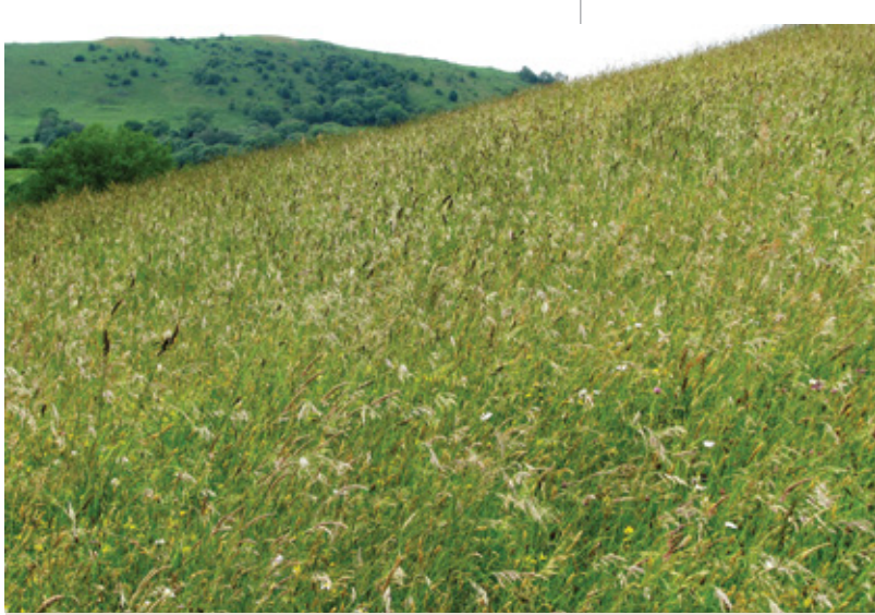
Hollybed Farm meadows